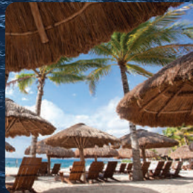
Costa Maya (Mahahual), Mexico