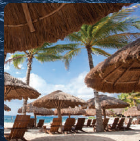
Costa Maya (Mahahual), Mexico