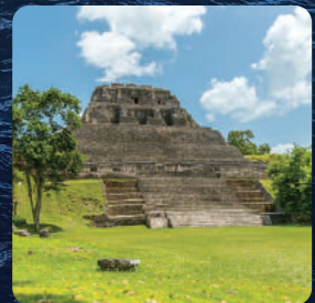
Belize City, Belize