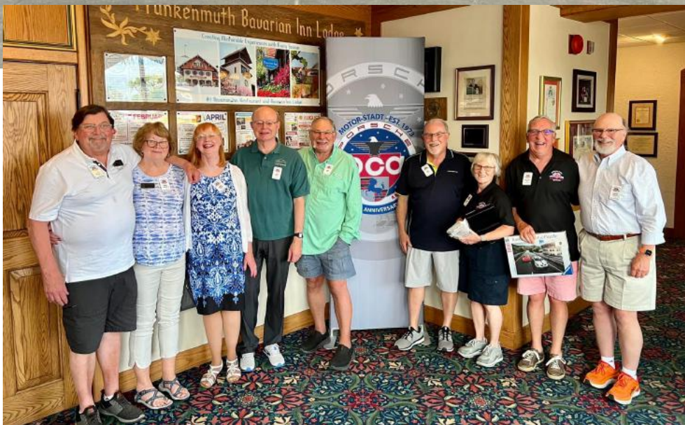
TOP – June 3, 2023, Motor-Stadt Region 50 th Anniversary. BOTTOM – Motor-Satdt Region PCA founding members.