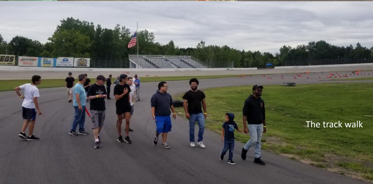
The track walk