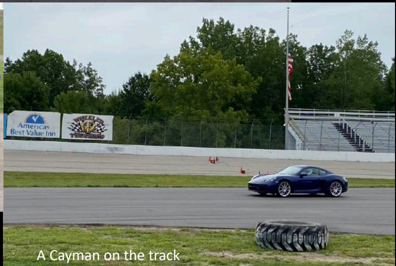
A Cayman on the track