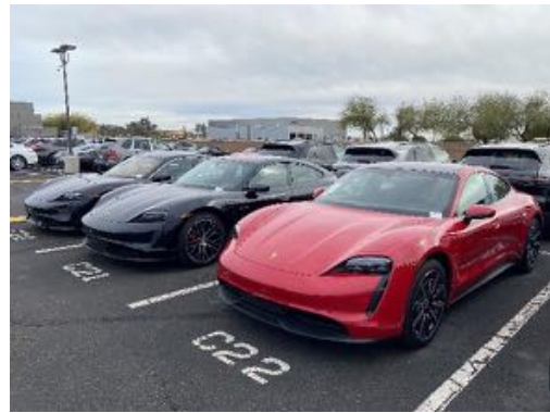
Photo 1 Parking lot at the North Scottsdale Porsche Dealership.