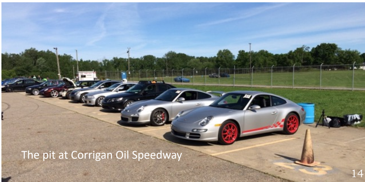
The pit at Corrigan Oil Speedway

Remember also the monthly member's meeting at Spagnuolos the second Tuesday of the month at 6:30 p.m., beginning on January 14. The board will notify you via email blasts, in this publication, and on our Facebook page if any driving/social events come up. Hope to see you, somewhere, soon.