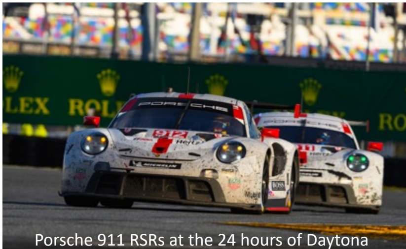
Porsche 911 RSRs at the 24 hours of Daytona

In January 2019 I attended the 24 hours of Daytona with my brother, who lives in Florida. Attending an event at that iconic track always is a special occasion, not the least reason being an escape from the northern winter. I missed it this year because of a ski weekend in the Petosky area. Oh well, can't be two places at once. Porsche did well again in 2020, placing 2 nd and 3 rd in the GT Le Mans class. BMW beat them to the line, garnering 1 st place. Porsche also took 4 th and 5 th in the GT Daytona class. Cadillac had a lock on the overall win, as it has in recent years, placing 1 st , as well as 3 rd , 5 th , and 7 th , in the Daytona Prototype class. Porsche has given up on prototype racing, but if they were still in it, they'd give Cadillac a run for their money. Rather, they're on to Formula E!